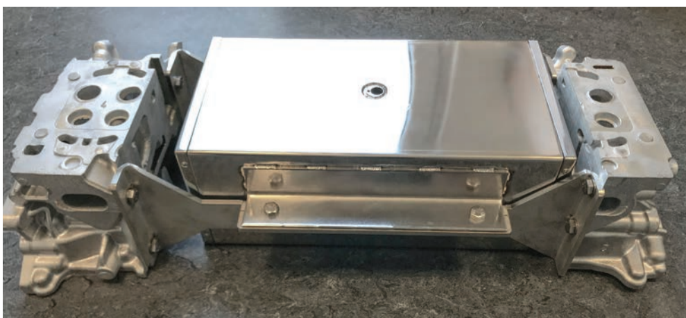
Prepared Aluminium part fitted with the PhoenixTM profile system