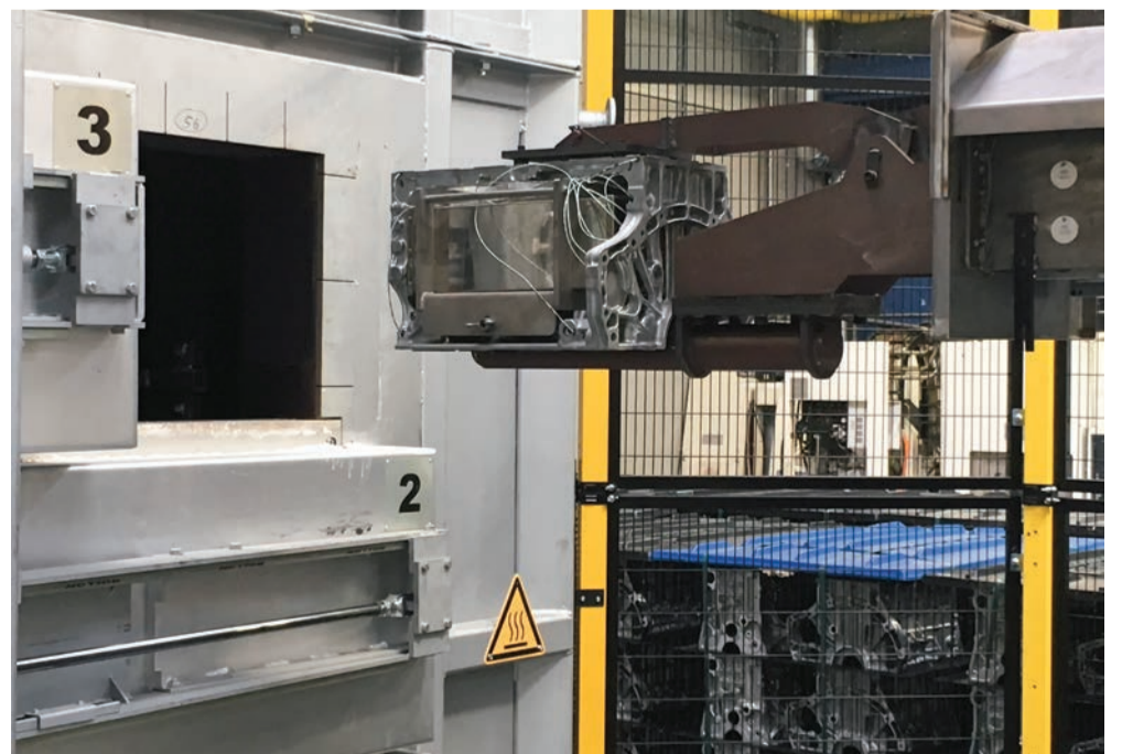
Component and PhoenixTM system being loaded into furnace by gripper