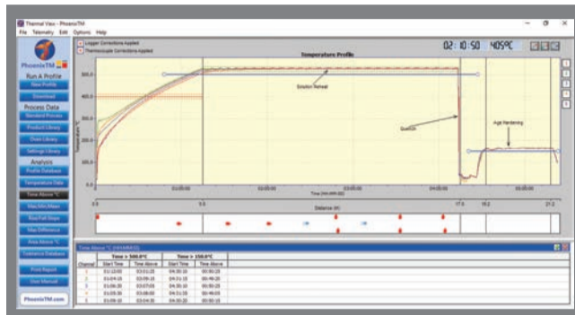
ThermalView Plus Software displaying the full process profile trace

Despite the success of the furnace technology, a problem arises. How can you measure the product temperature in such a rotary furnace in a meaningful way and comply with process standards? The furnace itself, like all industrial furnaces, is equipped with temperature sensors for regulation. But these sensors do not give any indication of what really happens internally or on the surface of the product. Previously, the actual product temperatures were measured using trailing thermocouples that had to be routed